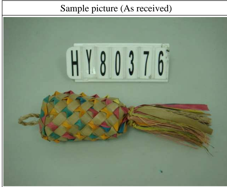
Sample picture (As received)